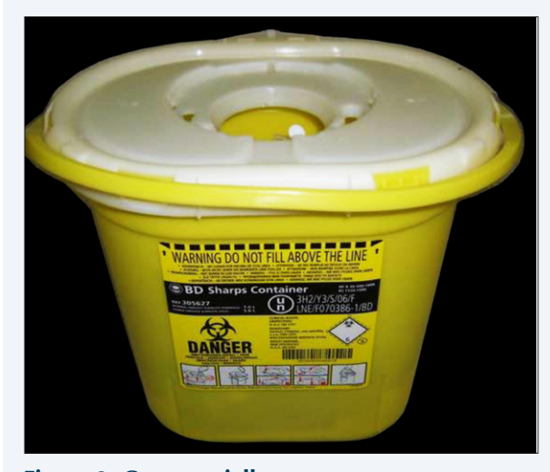
Figure 2. Commercially available boxes to collect sharps

Sharps (needles, scalpels, broken glass, knives, infusion sets) can cause cuts and puncture wounds if handled improperly. Person at risk are healthcare workers, workers in support services such as cleaners, workers transporting waste and workers in waste-management facilities. To prevent harm, sharps have to be collected in puncture-resistant, leak-proof and lockable boxes. Boxes of different sizes which comply with these requirements are commercially available (Fig 2). Attention should be paid not to overfill before closure. Closed sharps boxes can be disposed together with non hazardous waste if municipal regulations allow.