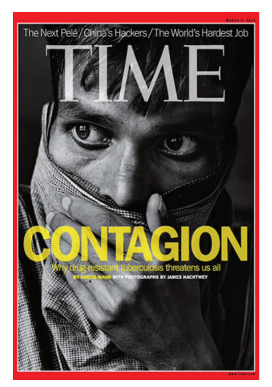
Fig. 2. In 2013, Time Magazine put drug-resistant tuberculosis on its front cover raising public awareness of this widespread threat to public health and to tuberculosis control programs. (Reproduced with permission.)

Indeed, in 2009 the World Health Assembly for the first time called explicitly for appropriate diagnosis and